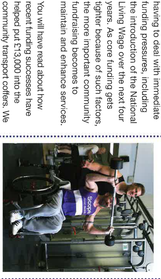
A fitness gym is also par of the plan.