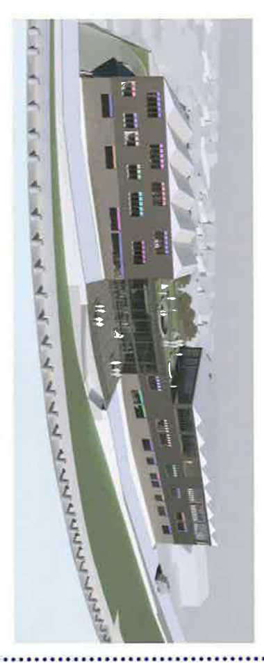
A bird's eye view of the New Centre 81 vision from above the River Bure

buildings that are well past their work in a range of second hand and volunteers doing amazing Our current centre sees staff "use by" date.