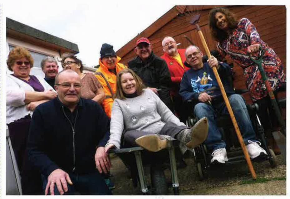
Gardening fun - with a wheelbarrow donated by the local In Bloom committee.

Other sessions enjoyed by Centre 81 members include: