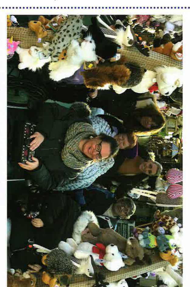
Having fun among the fluffy toys at the Highway Garden Centre.