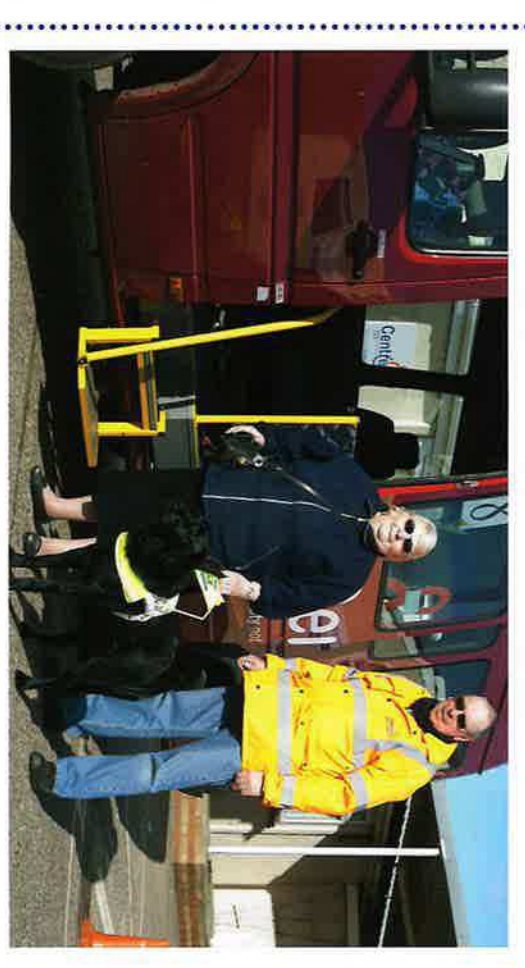
Centre 81's buses are accessible to all.