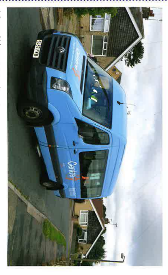
A Centre 81 bus on its rounds.

infirm. Without it people can be isolated, lonely and find it harder to live fulfilling lives."