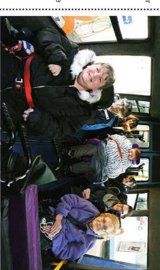
Centre 81 members heading out on the bus to Highway Garden Centre.

The trips use the centre's fully accessible community transport minibuses.