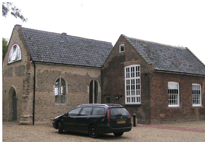
Pennoyer's School, Pulham St Mary, before and after restoration.