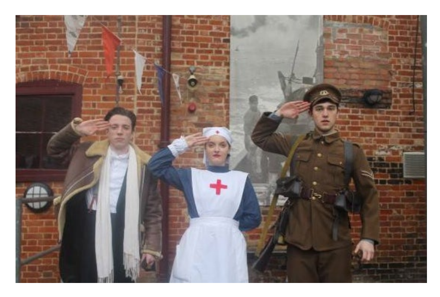
Time and Tide Museum's award-winning learning programmes