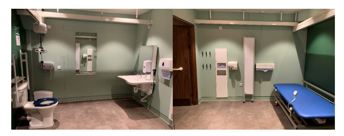
New 'pop-up' café, visitor toilets and Changing Place