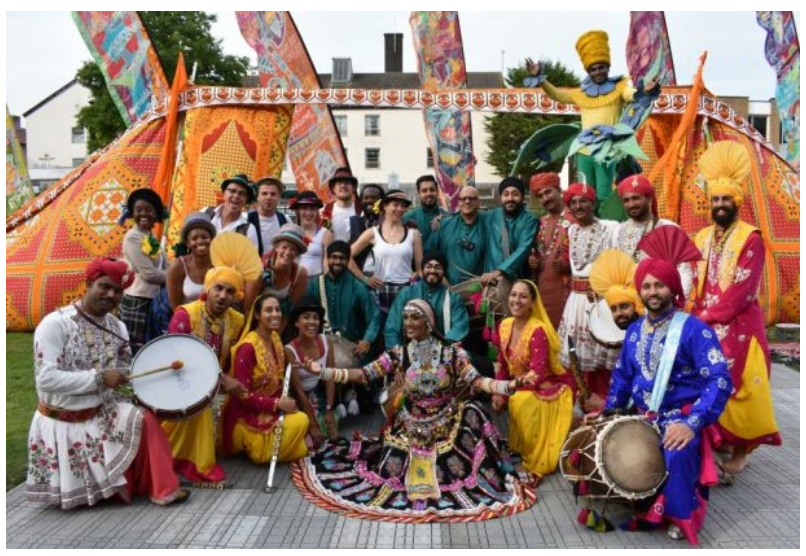
Festival of Norfolk and the Punjab, Thetford

Recent examples of our programming include the 'Slaves of Fashion' exhibition at Norwich Castle, curated by the Singh Twins, the Migration, Heritage and Belonging project in Great Yarmouth, and the annual Festival of Norfolk and the Punjab, focused on Ancient House Museum, Thetford, and co-curated with the Essex Cultural Diversity Project (ECDP).