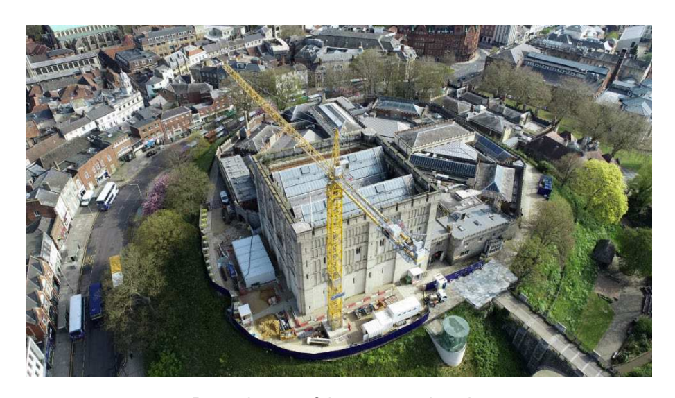
Drone image of the construction site

Sectional completion of the first phase of the project took place on 11 August 2022, with the formal handover of the new WC block area, which includes accessible toilets, baby changing facilities, a new Changing Place and a 'pop-up' catering facility. The Changing Place is now fully operational and registered <a href="https://www.changing-places.org/find?toilet=2026">https://www.changing-places.org/find?toilet=2026</a>.