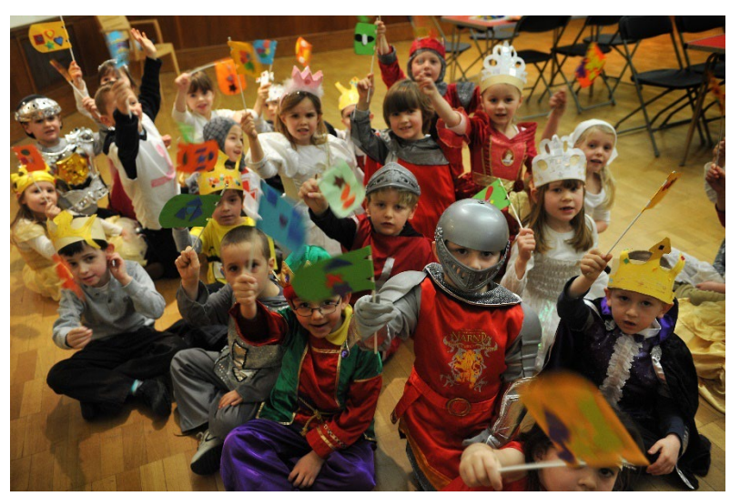
A Key Stage 1 schools session in Norwich Castle